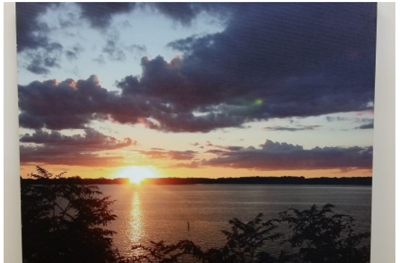
Sunset over Clear Lake Canvas Print by Don Luepke