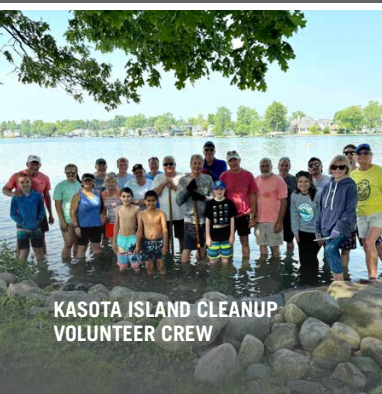
KASOTA ISLAND CLEANUP VOLUNTEER CREW

VOLUNTEER | CONTACT | DONATE clearlakeconservancy.org or call (260) 527-1072