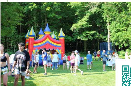
SCAN FOR RACE WINNERS

We are extremely grateful for 28 amazing sponsors that supported Run Day, Fun Day and our mission to protect Clear Lake's environment. Over 60 volunteers showed up to ensure this event was a day to remember. Catch the full Run Day, Fun Day recap in our next Clear Thinking newsletter.