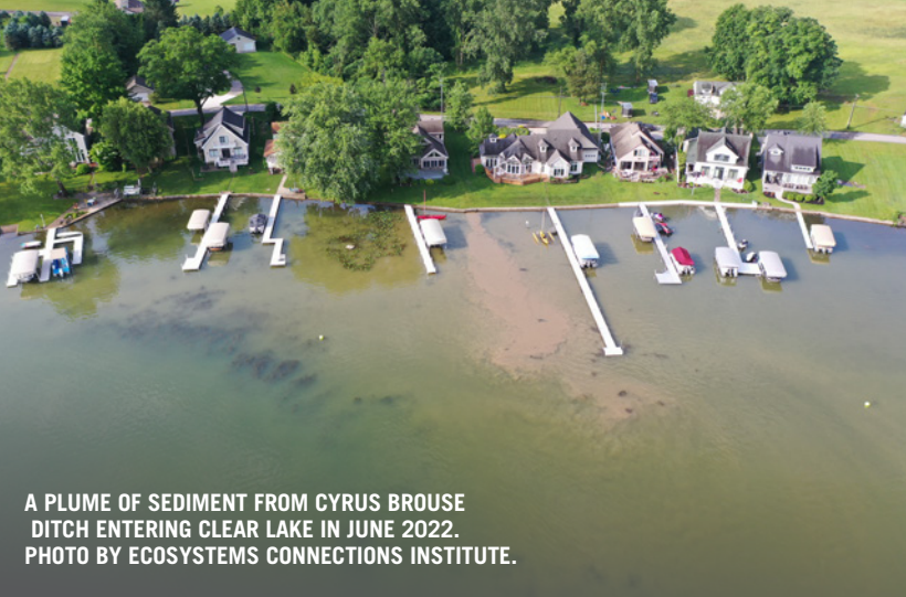
A PLUME OF SEDIMENT FROM CYRUS BROUSE DITCH ENTERING CLEAR LAKE IN JUNE 2022.