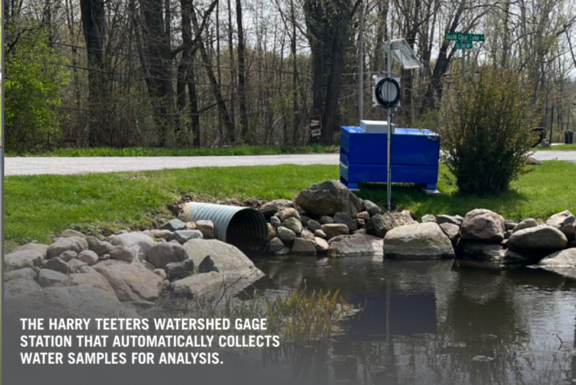
THE HARRY TEETERS WATERSHED GAGE STATION THAT AUTOMATICALLY COLLECTS WATER SAMPLES FOR ANALYSIS.