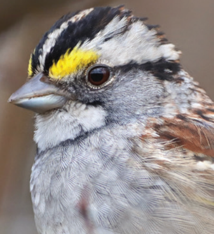
White-throated Sparrow | Shari McCollough