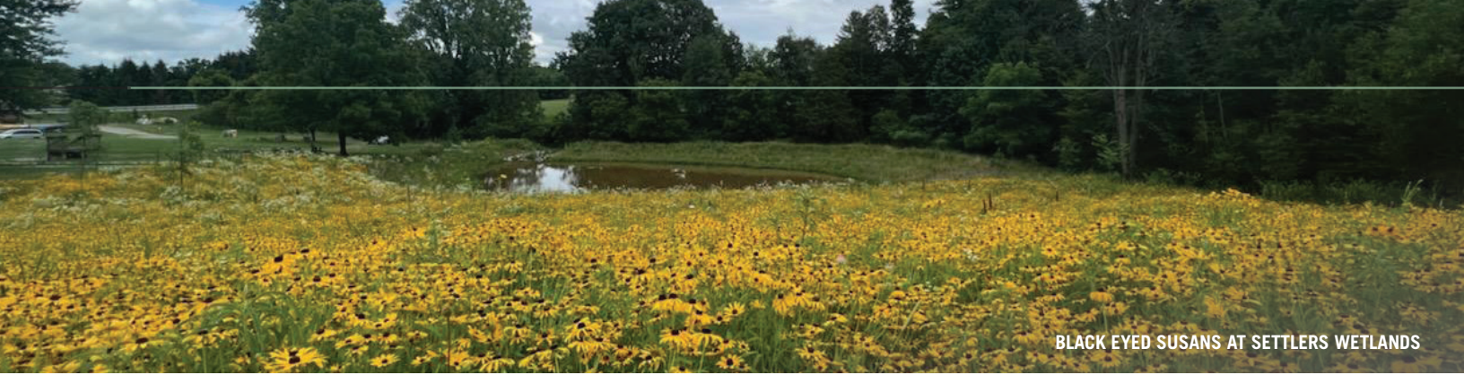
BLACK EYED SUSANS AT SETTLERS WETLANDS