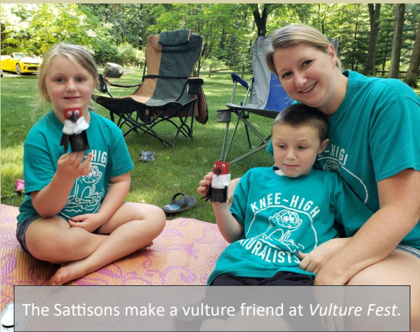
The Sattisons make a vulture friend at Vulture Fest.

The season continued with an in depth look into those big soaring birds we see above Clear Lake with Vulture Fest . Bridget Harrison shared the good, the bad, and the YUCKY of these soaring creatures with attendees. Everyone left with more knowledge of the large birds, whether they wanted to know it or not and a make and take vulture friend!