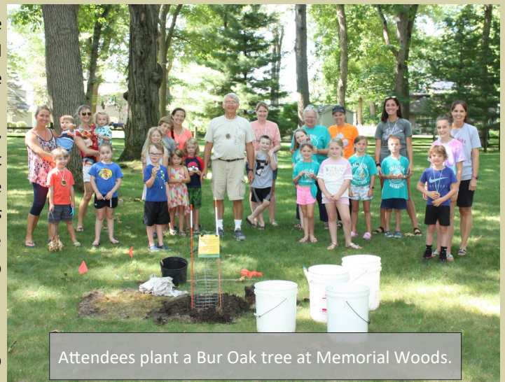
Attendees plant a Bur Oak tree at Memorial Woods.

themed session during this "Year of the Tree." At our All About Oaks session, everyone learned the reasons to love the Oak Tree and the differences between white oaks and red oaks. Together, the group planted a bur oak tree on the Memorial Woods Nature Preserve, and each family took their own bur oak home to plant.