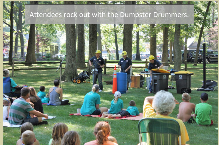
Attendees rock out with the Dumpster Drummers.

Starting with a BOOM, we began the season with The Dumpster Drummers. This engaging group entertained all ages with a musical performance on recycled materials. Participants got to Rock Out as they learned the importance to reduce, reuse, and recycle for environmental conservation! Some participants even left energized to share the message with neighbors in private neighborhood concerts!