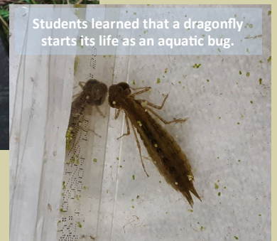
Students learned that a dragonfly starts its life as an aquatic bug.

Stay Connected. Email info@clearlakeconservancy.org to sign up for e-news and events.