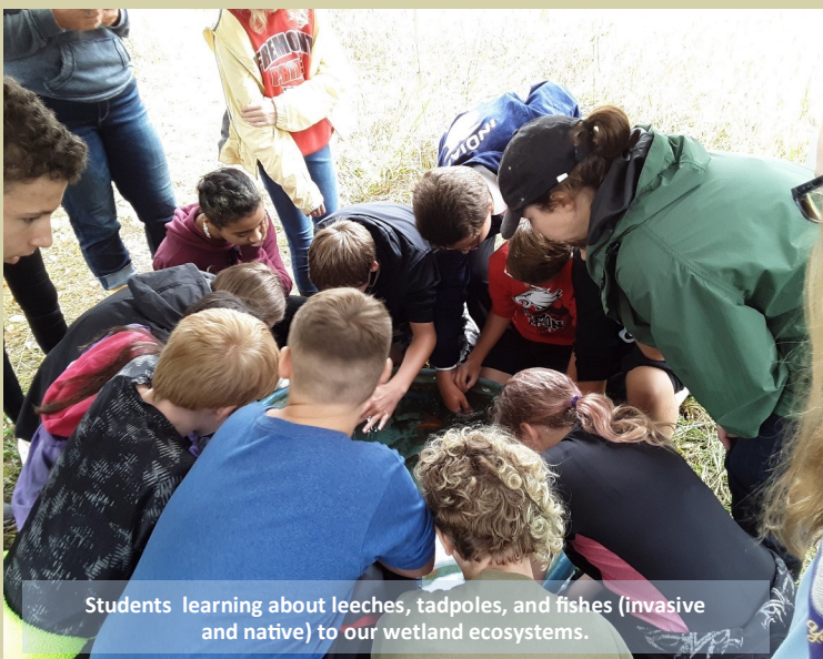
Students learning about leeches, tadpoles, and fishes (invasive and native) to our wetland ecosystems.

In early October, we led the 'Swamp Zoo' station at Duck Day, organized by Ducks Unlimited and several partners. Just under 350 7th graders participated in the event, spanning two full days. At 'Swamp Zoo' students learned about the function of wetlands acting to filter pollutants out of water before flowing into streams, lakes and rivers. They held and learned about critters that rely on this important ecosystem and how to use macro-invertebrates, big bugs, to determine water quality.