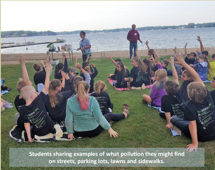
Students sharing examples of what pollution they might find on streets, parking lots, lawns and sidewalks.

Staff and volunteers of the Conservancy have thoroughly enjoyed educating our area youth this past Summer. In September, over 250 4th graders participated in the annual Youth Conservation Field Day, organized by the Steuben County Soil & Water Conservation District. 'A-maze-ing Race', a maze on the beach at Potawatomi Inn was organized and led by our staff and volunteer, Don Luepke. This station gives students the chance to learn about how water flows over our streets, lawns, and sidewalks, all while collecting and carrying pollution to nearby lakes, streams and rivers. This hands-on activity teaches that we can positively impact waterways by not littering, cleaning up after our pet and following labels for common lawn care items.