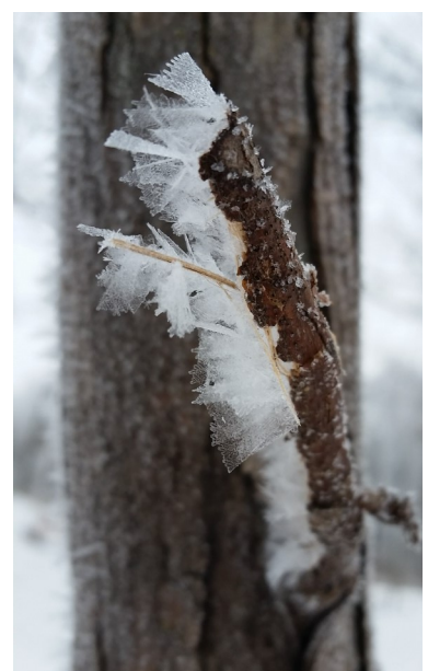
Winter in Brennan Woods

Nonprofit Org. U.S. Postage PAID Fort Wayne, IN Permit No. 760